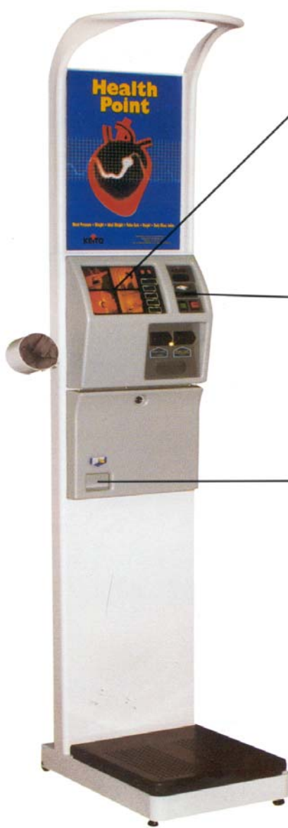
Fully automated monitor with voice instructions for use