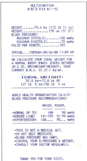
Results ticket (50% of real size)

Deposit 4 quarters for Full Function Including Blood Pressure